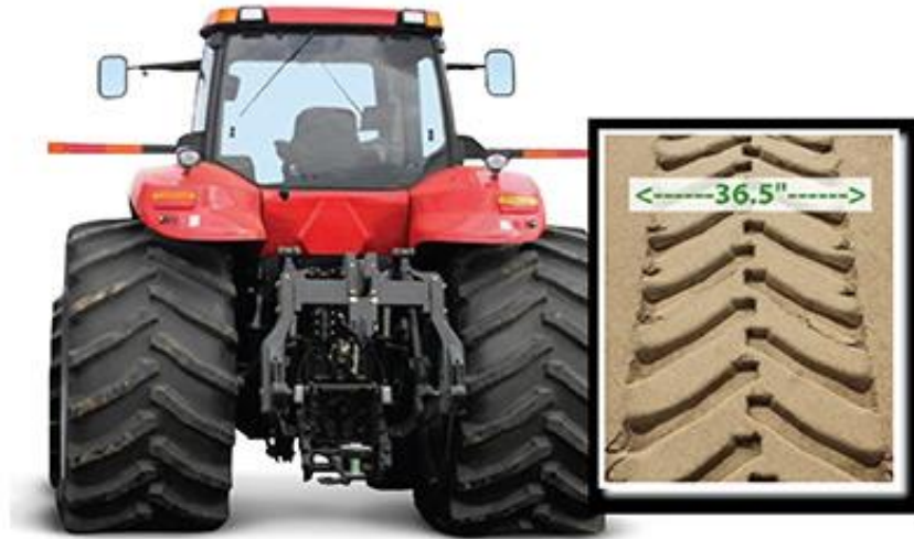
▲ GOODYEAR SUPER SINGLES