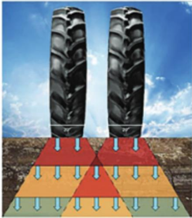
▲ DUAL SETUP COMPACTION