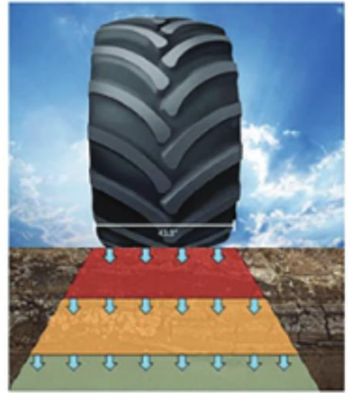
▲ SUPER SINGLE SETUP COMPACTION