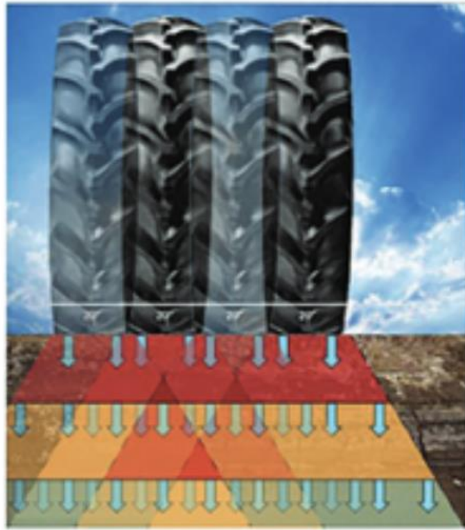
▲ COMPOUNDED COMPACTION OVER TIME