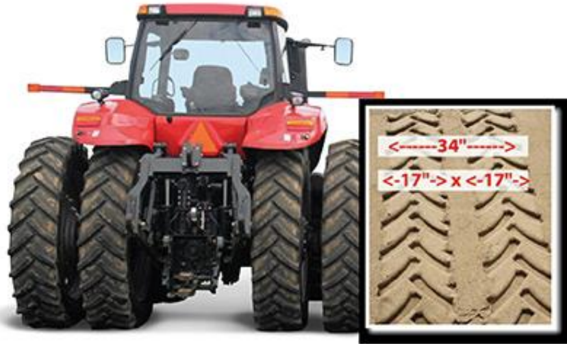
▲ NARROW DUALS