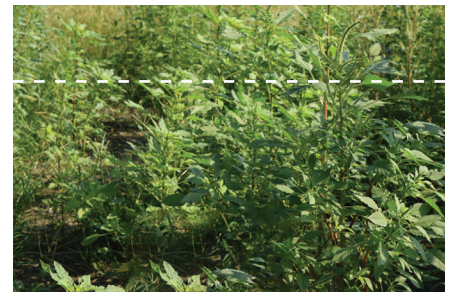
Warrant® followed by XtendiMax® With VaporGrip® Technology + glyphosate + Warrant® Three effective SOAs

2019 Syngenta bare ground herbicide demo, soybeans; Kinston, North Carolina.