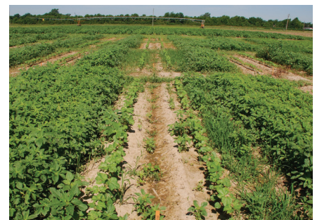
XtendiMax With VaporGrip Technology

2017 Syngenta trial HDC102A4, cotton; Mississippi.