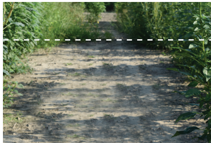
Prefix® followed by Tavium® + glyphosate Four effective SOAs

Images taken 55 days after post-emergence application